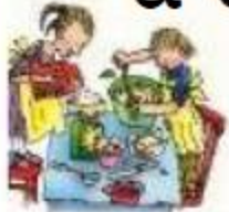
Make a cake