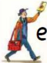
A better letter