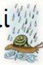
Snail in the rain.