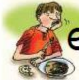
Chew and stew