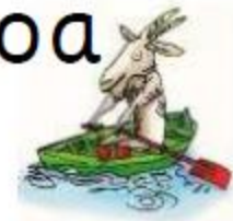
Goat in a boat