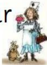
Nurse with a purse