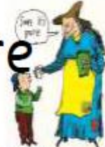
Sure its pure