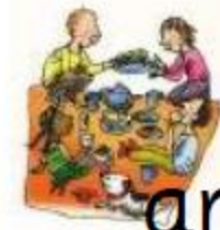
Care and share